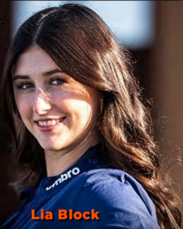
Lia Block 2023 RWD ARA National Champion, Baja Champion, F1 Academy for Williams

Our inaugural event was attended by 100 participants, leaving standing room only in our classroom space.