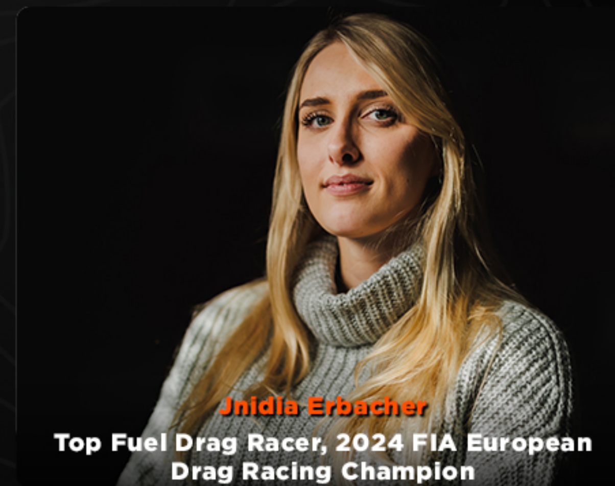
Jnidia Erbacher Top Fuel Drag Racer, 2024 FIA European Drag Racing Champion