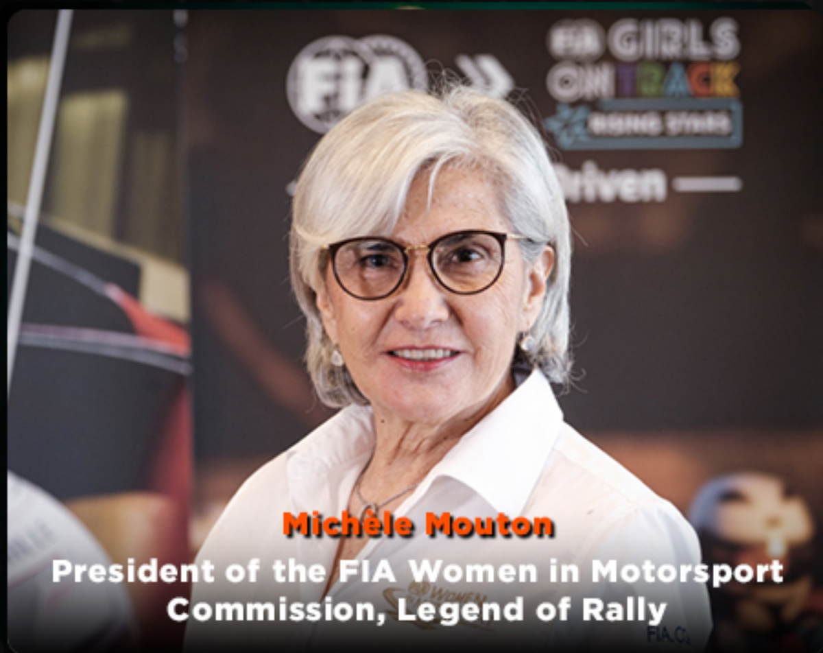
Michèle Mouton President of the FIA Women in Motorsport Commission, Legend of Rally

Our 2024 Summit was attended by 500 people in person and 6,000 people on the Live Stream.